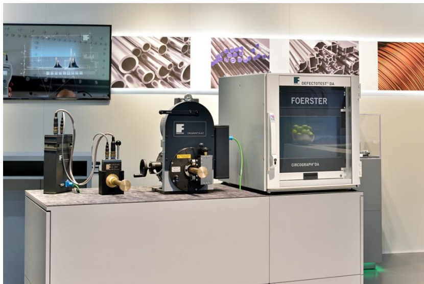
Figure 2: Introducing the new CIRCGRAPH DA with the rotating head Ro 20 F for fast applications