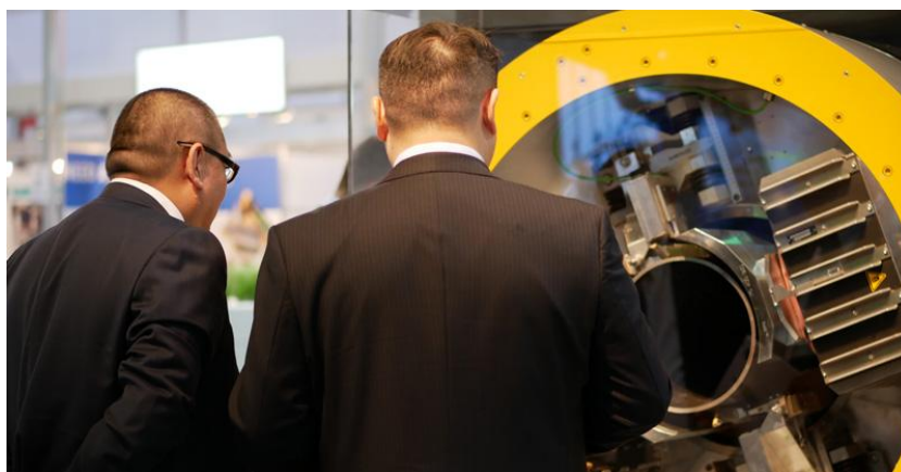
Figure 4: Visitors showed great interest in the new generation test system