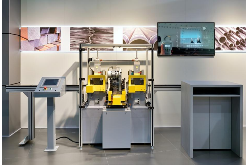
Figure 5: Automated test section