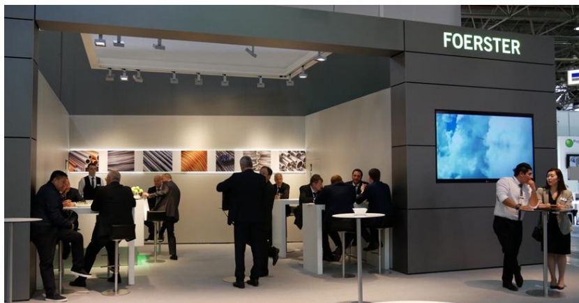
Figure 1: FOERSTER booth at Tube & wire 2018