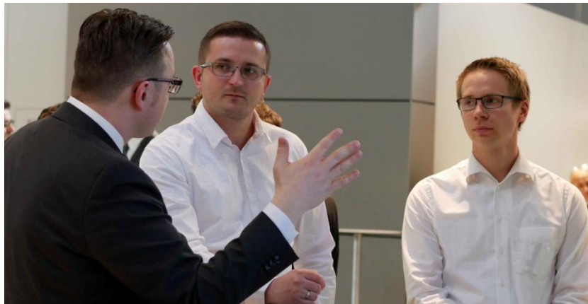
Figure 6: Many interesting discussions with customers took place